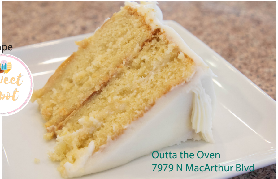
Outta the Oven 7979 N MacArthur Blvd