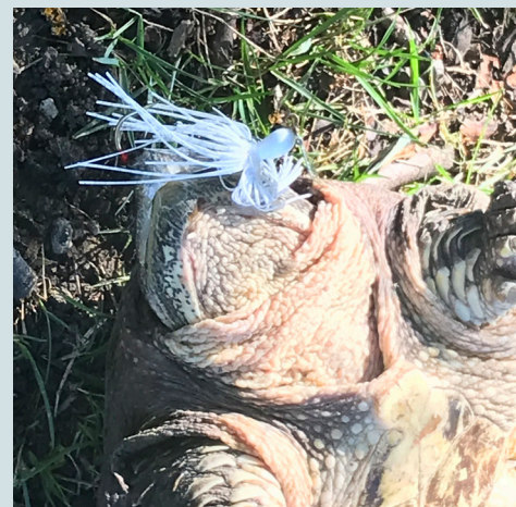
This turtle was found with a hook in its mouth. LCA Common Property Representatives successfully removed the hook and the turtle is currently enjoying its life at Rochelle park.

We are approaching the shortest period of daylight and the longest night of the year, Friday, December 21st. If you notice any commercial building lights or parking lot lights that are out, please report them to Property Compliance at 972-541-2345.