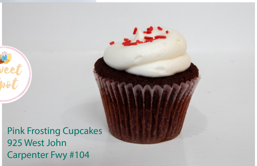
Pink Frosting Cupcakes 925 West John Carpenter Fwy #104