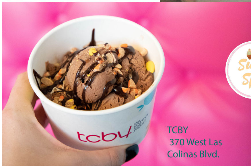
TCBY 370 West Las Colinas Blvd.