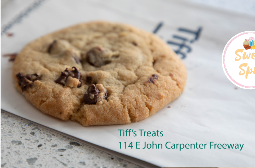
Tiff's Treats 114 E John Carpenter Freeway