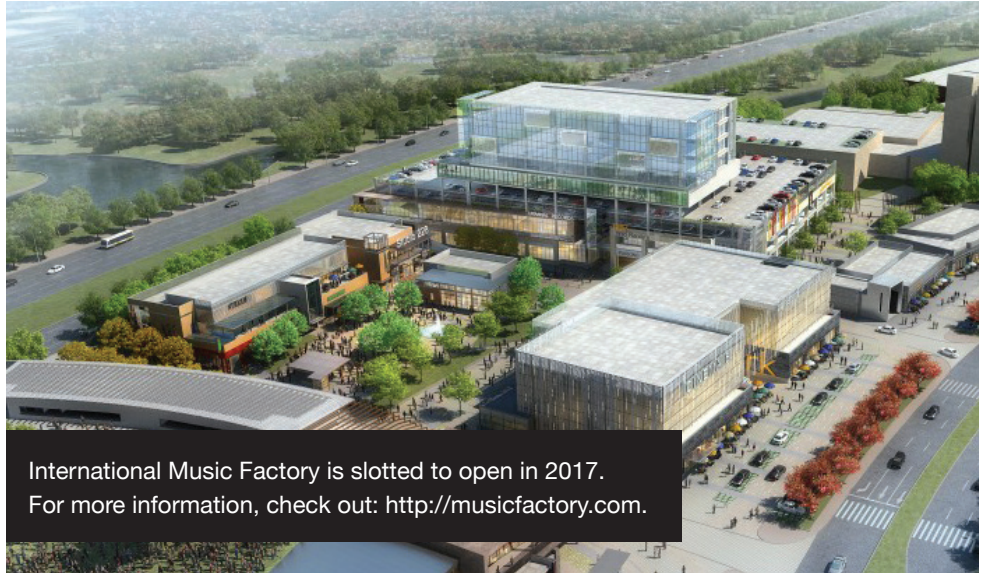
International Music Factory is slated to open in 2017. For more information, check out: http://musicfactory.com .

Campion Trail is now open however, park patrons should be aware that some damaged sections and amenities are not yet safe for use. For trail maps and details, visit CityofIrving.org/Parks .