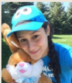
First picture with bunny. March 30, 2015