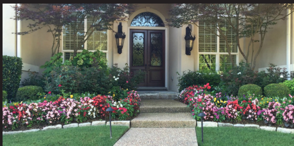
JAVIER & TERE CREIXELL 1826 Cottonwood Valley Circle North • Irving, TX 75038