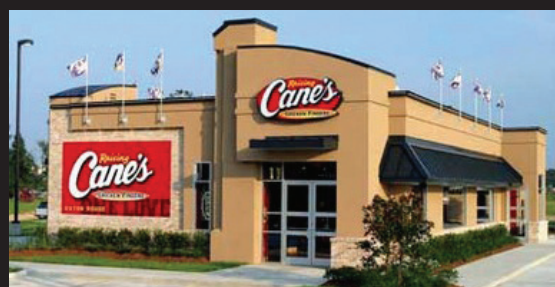
RAISING CANE'S 7955 N. MacArthur Blvd. • Irving, TX 75063