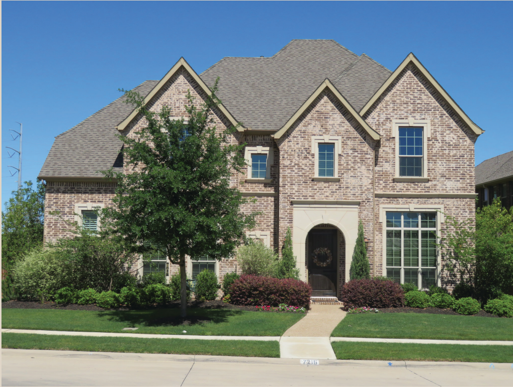
7216 Comal at Riverside Village Kevin and Crystal Muenster