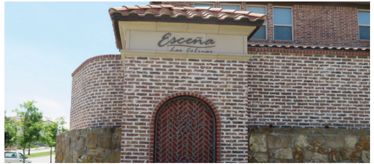
Entrance of Villas At Escena