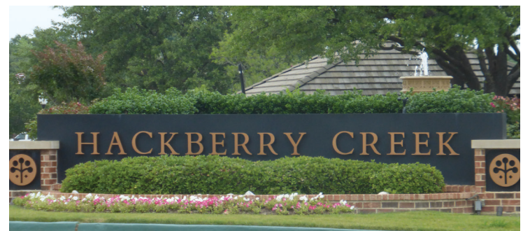
Hackberry Creek monument sign