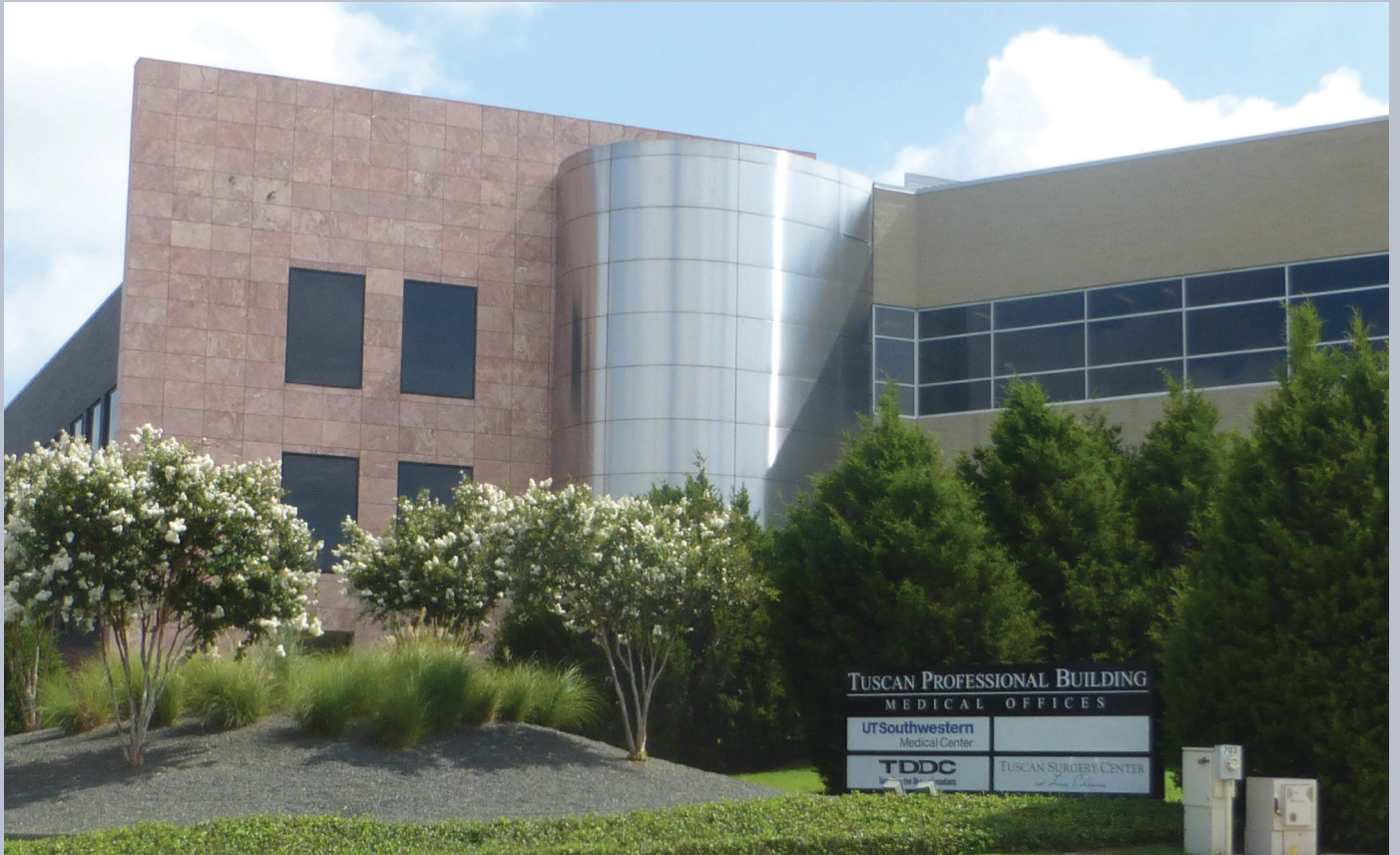
Tuscan Professional Building, 701 Tuscan Drive