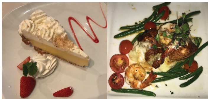
Key Lime Pie (left) and blackened salmon and adobo shrimp with mashed Yukon gold potatoes and lobster cream (right).

The waiter brought a dessert menu featuring Cream Brulee, Chocolate Cake, Key Lime pie, classic Tres Leche, and Flan. Again, I took his recommendation and ordered the Key Lime pie. If you love Key Lime pie like me, you need to go to Via Real. Custard tart filling topped with homemade vanilla whipped cream...to die for! But this is layered