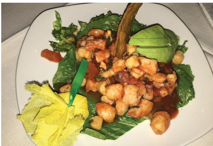
Ceviche- refreshing shrimp and bay scallops marinated in lime and tomato juices.

on a special graham cracker crust with very subtle bits of toasted coconut and almonds. You can't taste the coconut or the almonds but it adds a very nice