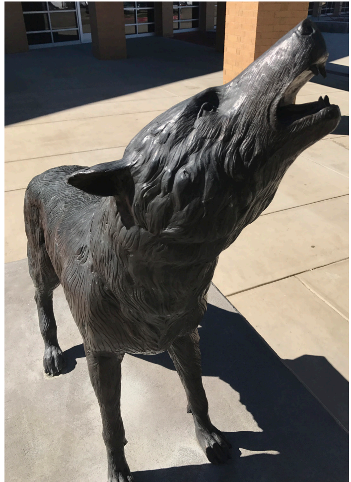
Statue of Ranchview High School's mascot.