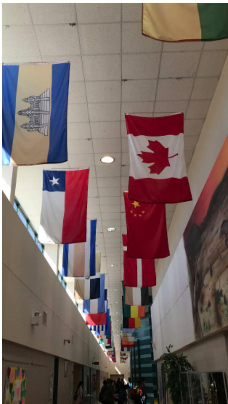
Hallway featuring flags from all around the world at Barbara Bush Middle School .