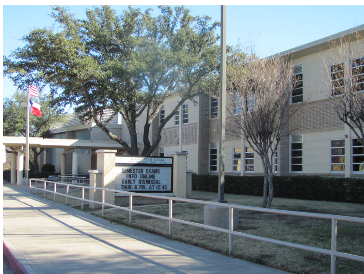
At Travis Middle School, teachers strive to get students involved in different organizations in hopes that they will continue to stay involved in high school.

the workforce. The high school emphasizes college prep and vocational programs but also offer a strong JROTC program that is almost evenly split between the genders. Several Apple computer labs help keep students in the loop on technology and most software at the high school is updated every 3 years.