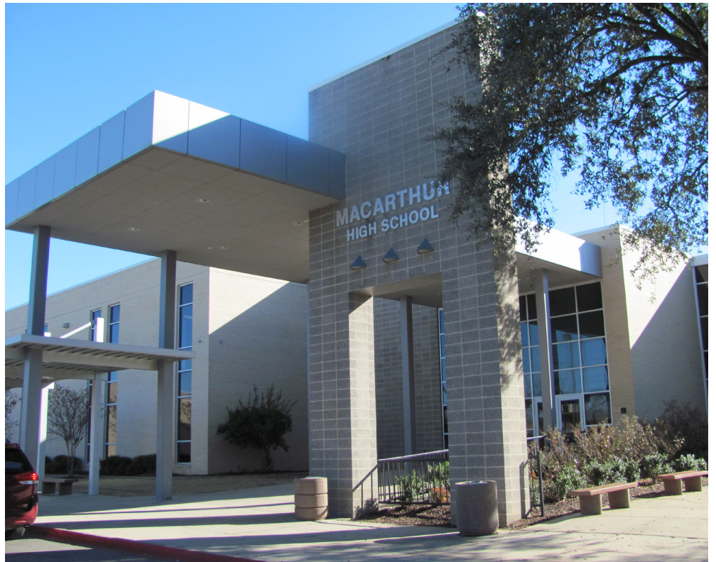
MacArthur Highschool is located at 3700 North MacArthur Blvd., Irving, Texas 75062.

Representative of a school district that serves the most diverse zip code in the United States (75038), there are over 56 languages spoken in the Irving School District. Irving ISD schools teach different languages as early as elementary