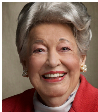
Ebby Halliday (2000s)

where they don't feel like they have to go downtown, or to North Dallas, or to somewhere to entertain themselves, have a good time, try something new." Purchasing a home is more than an investment. "That's