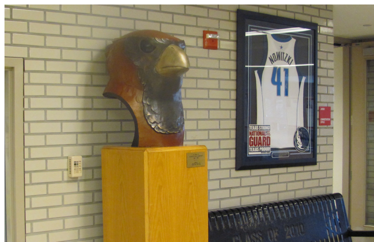
The Cardinal is MacArthur's mascot.

Hands-on experience will give MacArthur High School graduates the upper hand when they enter