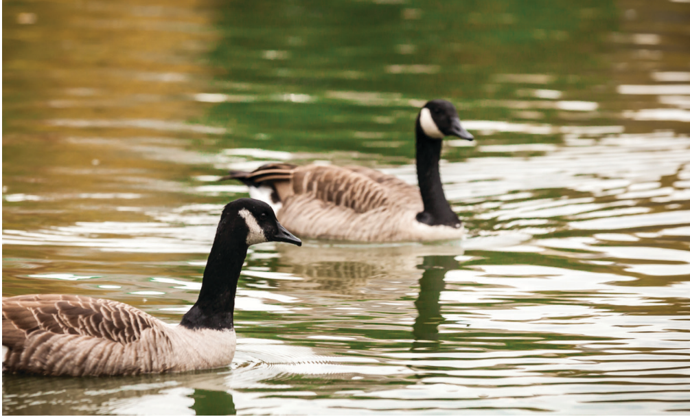
Canadian geese are visting Las Colinas en route to their warmer destination.