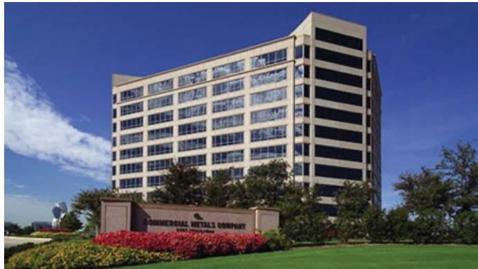
The corporate headquarters of Commercial Metals Company located on North MacArthur Blvd.

As of October 2016, at the top, ExxonMobil ranks number 2 with a $246 billion in revenues. Kimberly-Clark ranks 151 with $18 billion in revenues, following closely, Fluor ranks 155 with $18 billion in revenues. Commercial Metals came in at 417 with $6 billion in revenues and not too far behind, Celanese placed at 453 with $5 billion in revenues.