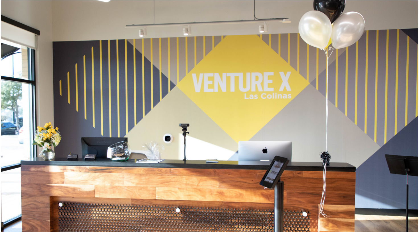
Venture X is located at 955 West John Carpenter Fwy, Suite 100 in Irving, Texas.