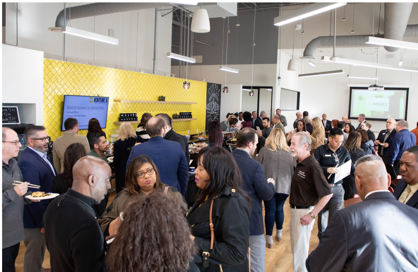
Venture X Las Colinas opened for business last January.

Las Colinas has other modern office spaces that are similar to WeWork and Venture X. Regus has several office spaces in Las Colinas. One of their office spaces, the 10th floor of MacArthur Center II at 5605 North MacArthur Blvd, has meeting rooms, a business lounge, and co-working spaces. Memberships range from pay-as-you-go to fixed term. Between WeWork, Venture X, and Regus, Las Colinas offers lots of office space options for the big business, entrepreneurs, and startups. Is this the future of the modern office? Will employees get used to sharing their space with others from different fields and companies? Time will tell.